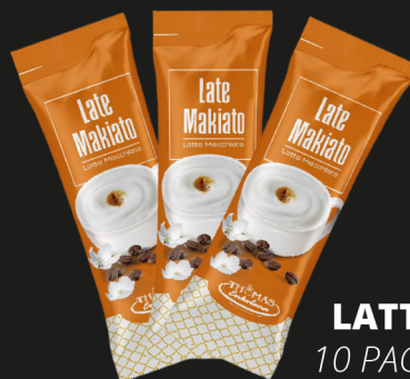
LATTE MACCHIATO 10 PACKETS X 14 G EACH