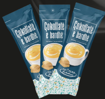
WHITE CHOCOLATE 10 PACKETS X 25 G EACH

AT HOME Boil around 125-150ml milk in a small pot. Pour 4-5 tablespoons of the milk into the sachet's powder and mix them vigorously. This will stimulate foam formation when you add the remaining milk.