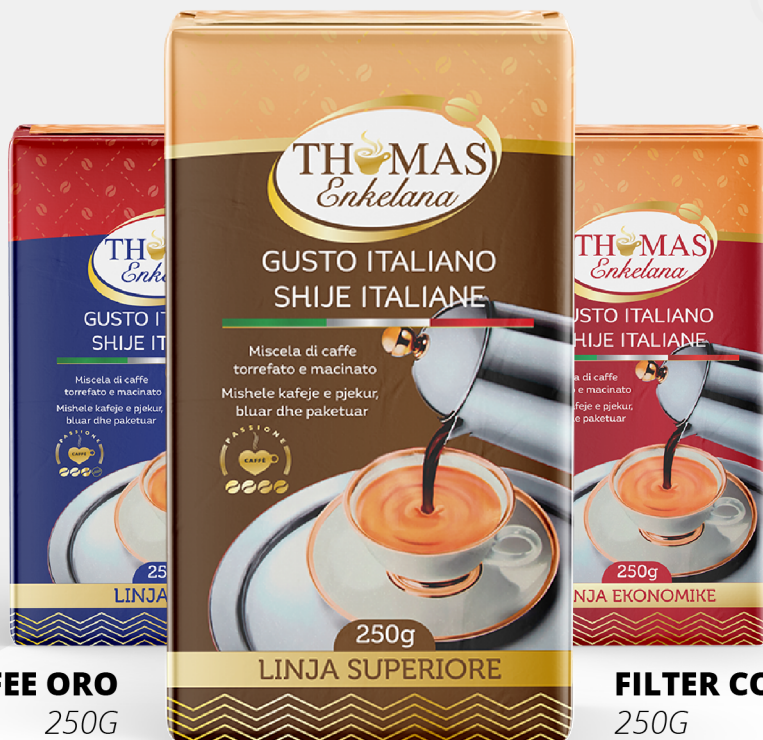
FILTER COFFEE ORO 250G

PROVIDED IN SUPERIOR LINE, ORO LINE AND ECONOMICAL LINE