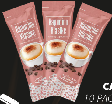
CAPPUCCINO 10 PACKETS X 14 G EACH