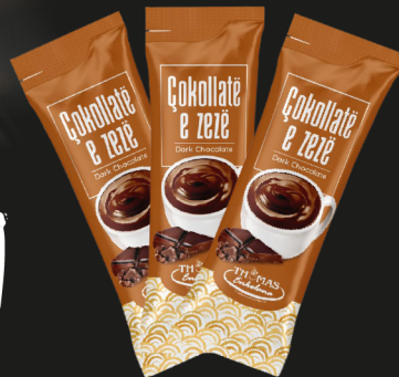
DARK CHOCOLATE 10 PACKETS X 25 G EACH