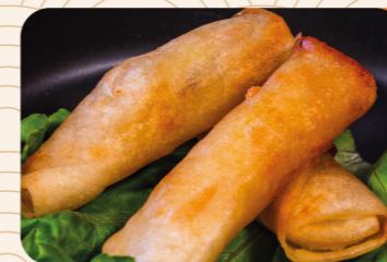
Spring Rolls (8 copë/ 8 pcs) 490 lek