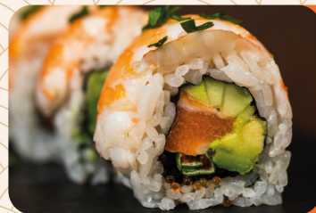
Ebi Roll (8 copë/ 8 pcs) 1290 lek