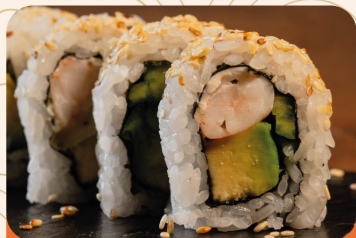
California Roll (4 copë/ 4 pcs) 490 lek