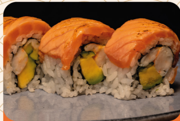
Alaska Roll (4 copë/ 4 pcs) 590 lek