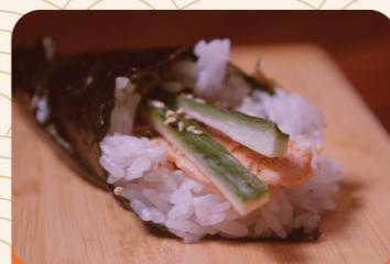
Temaki Barbecue (2 copë/ 2 pcs) 350 lek