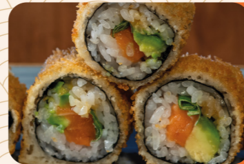
Crunchy Roll (8 copë/ 8 pcs) 1290 lek