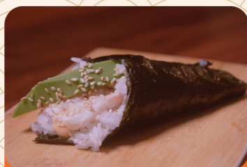
Temaki California (2 copë/ 2 pcs) 350 lek