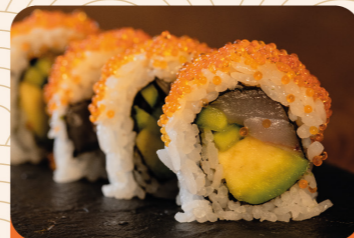
Pimpa Roll (4 copë/ 4 pcs) 520 lek