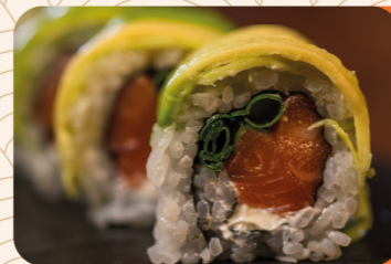
Hana Roll (8 copë/ 8 pcs) 1290 lek