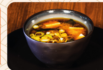
Miso Soup 1290 lek