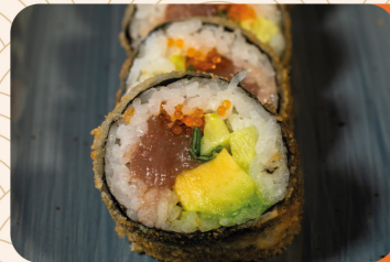
Tsuna Roll (8 copë/ 8 pcs) 1290 lek