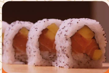
Amazon Roll (4 copë/ 4 pcs) 520 lek