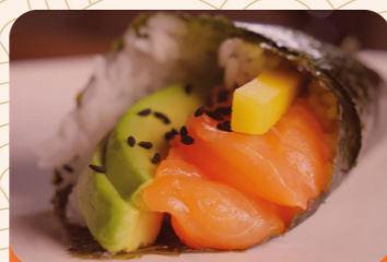
Temaki Salmon (2 copë/ 2 pcs) 350 lek