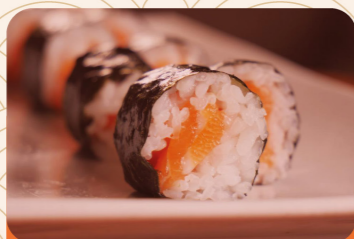
Hosomaki Salmon (4 copë/ 4 pcs) 450 lek