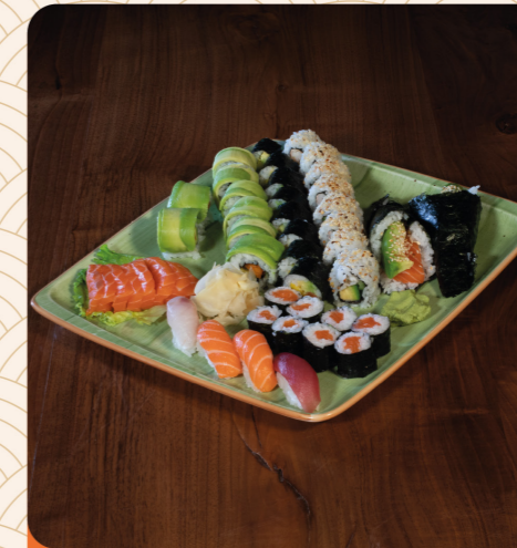
Special Box Two (sashimi, kalifornia roll, maki classic, maki crab, temaki salmon, nigiri) 4700 lek