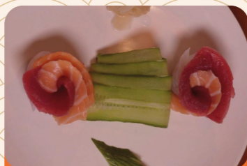
Mix Sashimi (8 copë/ 8 pcs) 950 lek