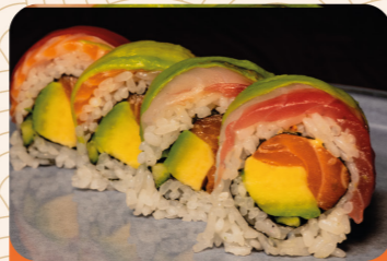
Rainbow Roll (4 copë/ 4 pcs) 590 lek