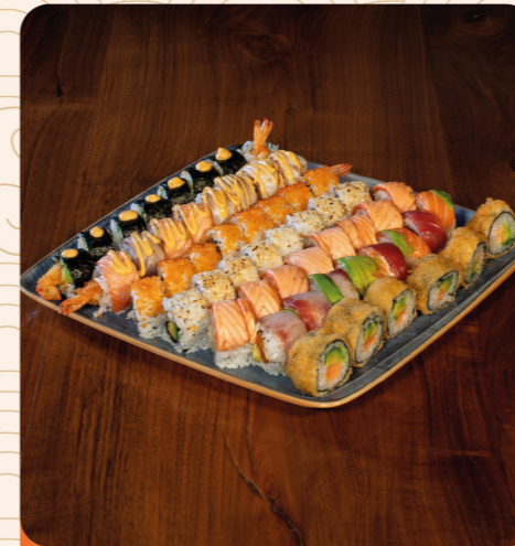
Special Box One (rainbow roll, alaska roll, cruchy roll, ebi roll, white fish roll, special roll, fotomaki karkalec tempura) 5800 lek