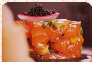
Tartar Salmon 990 lek