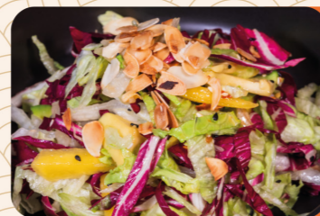
Soje (Miks sallatrash, filiza soje, avokado, mango, salce ginger, bajame te pjekura) 590 lek