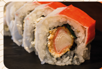
Nipon Roll (8 copë/ 8 pcs) 1290 lek