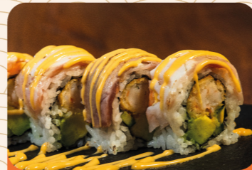
Special Roll (4 copë/ 4 pcs) 590 lek