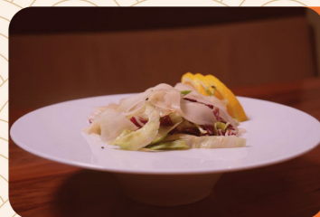
Ginger (Miks sallatrash, karrote, avokado, susame, shege, bajame & salce gingeri) 590 lek