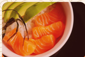
Chirashi Salmon 890 lek