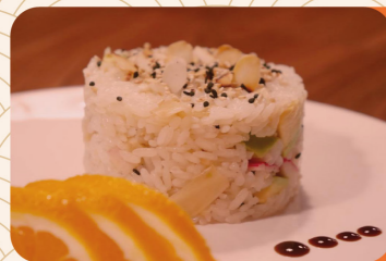
Orizi (Oriz, karkalec, oktapod, avokado, mango, salce gingeri, bajame te pjekura) 590 lek