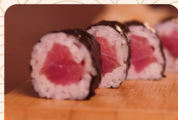
Hosomaki Tuna (4 copë/ 4 pcs) 450 lek