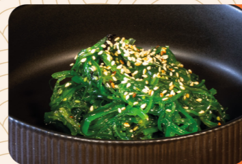
Wakame 500 lek