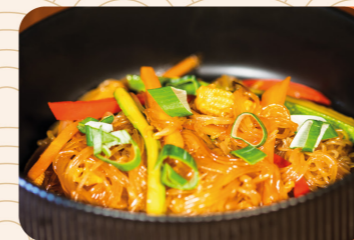
Vermicelli 500 lek