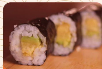
Hosomaki Avokado (4 copë/ 4 pcs) 390 lek