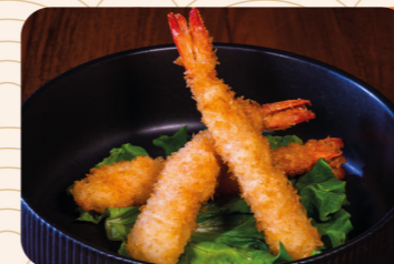
Karkalec Tempura (8 copë/ 8 pcs) 1290 lek