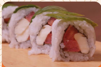
Capri Roll (4 copë/ 4 pcs) 490 lek