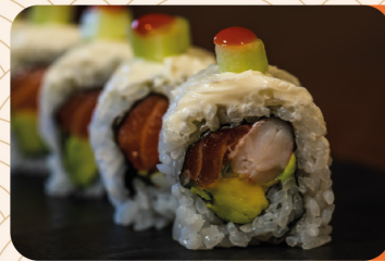
Karashi Roll (8 copë/ 8 pcs) 1290 lek