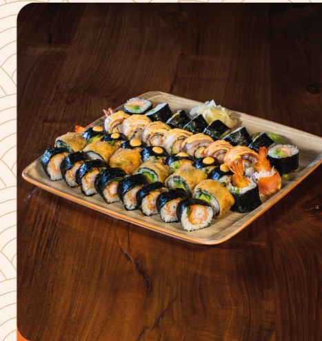
Mix Tempura (40 copë/ 40 pcs) 4200 lek