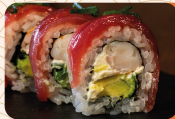
Maguro Roll (8 copë/ 8 pcs) 1290 lek