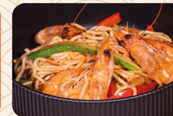
Nudels Fruta Deti Pulë Perime 1290 lek