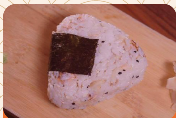
Onigiri 290 lek