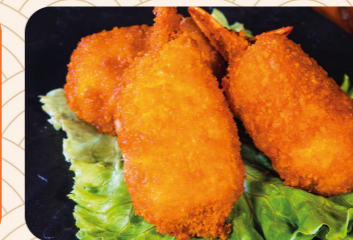
Këmbë Gaforre (8 copë/ 8 pcs) 890 lek