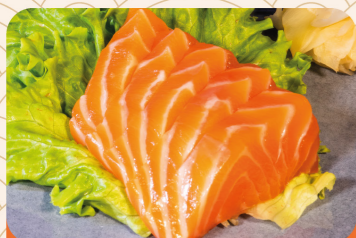
Sashimi Salmon (8 copë/ 8 pcs) 890 lek