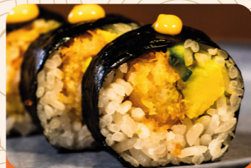
Futomaki Karkalec Tempura (4 copë/ 4 pcs) 490 lek