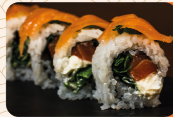
Smoked Salmon Roll (8 copë/ 8 pcs) 1290 lek